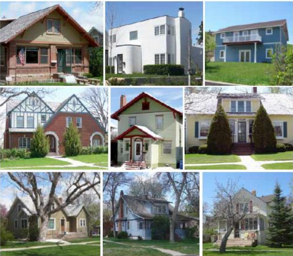
A Homeowner's Guide for Preservation

Nore Winter and Company was selected for a multiple phase contract to provide a Design Handbook for the West Boulevard Historic Preservation District. In April 2012, the Draft Handbook was available for review with a public meeting held to receive public comment. The Historic Preservation Commission then met with the consultant to review all comments. The Handbook should help address the regulations in place and is to be used as a tool to inform the public about the regulations. Phase III, the final adopted plans, will be requested as part of the 2012-2013 CLG Grant.